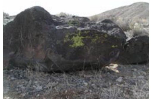
This rock has a pictograph of a goats head on it.