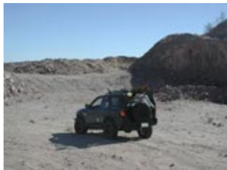
Walt was part of our group on Day 1 of the Mapping Trip.