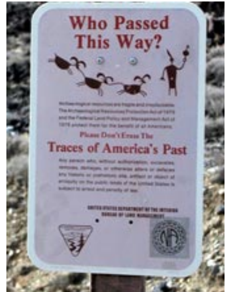
This sign is from the area that you can visit by foot. Their are rocks with pictographs on them in this area.