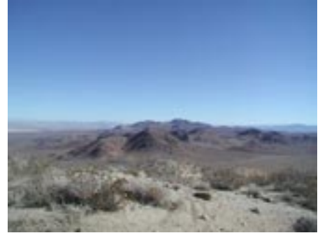
Excellent view from the Day 1 mapping trip in the SlashX area.