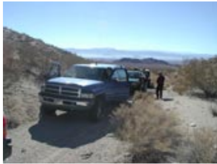
Day 1 mapping trip in the SlashX area.

Also, please feel free to send me recipes. I need those as well.